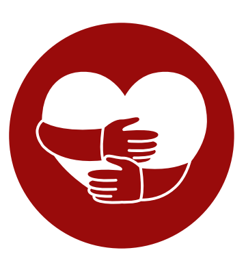
Healthy Laughter To You