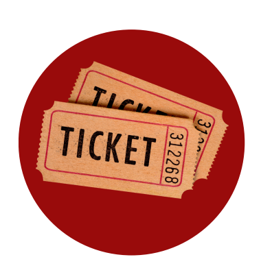
National Comedy Tour Expands