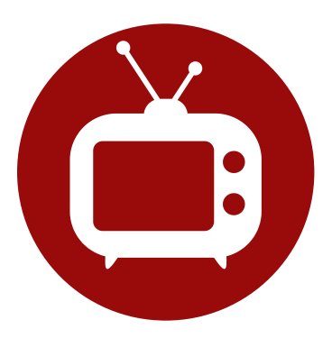
Debut of Comedy Special