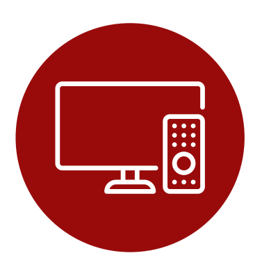
26 Episode Television Series