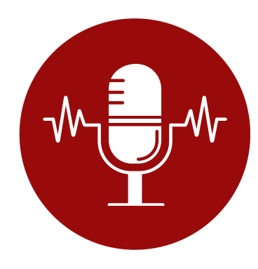
Healthy Laughter Podcast